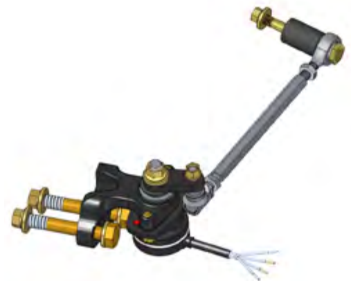
72-794 with sensor (Sensor not included)